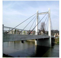
W = 30mm, H = 30mm