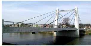
W = 40mm, H = 20mm