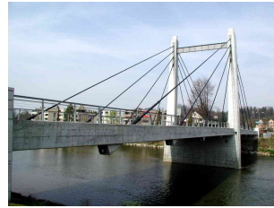
W = auto., H = 30mm